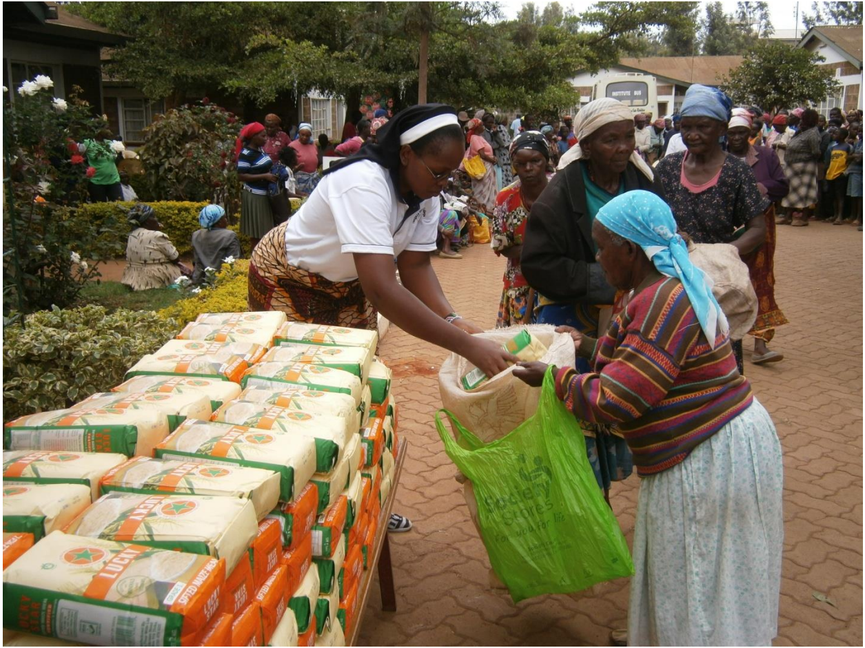
Distribution of food at Emmanuel Centre .