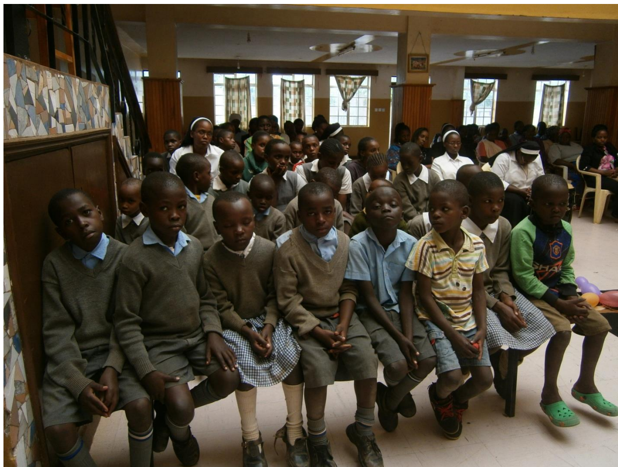
Children from St. Monica and Emmanuel centre at mass together with the workers.