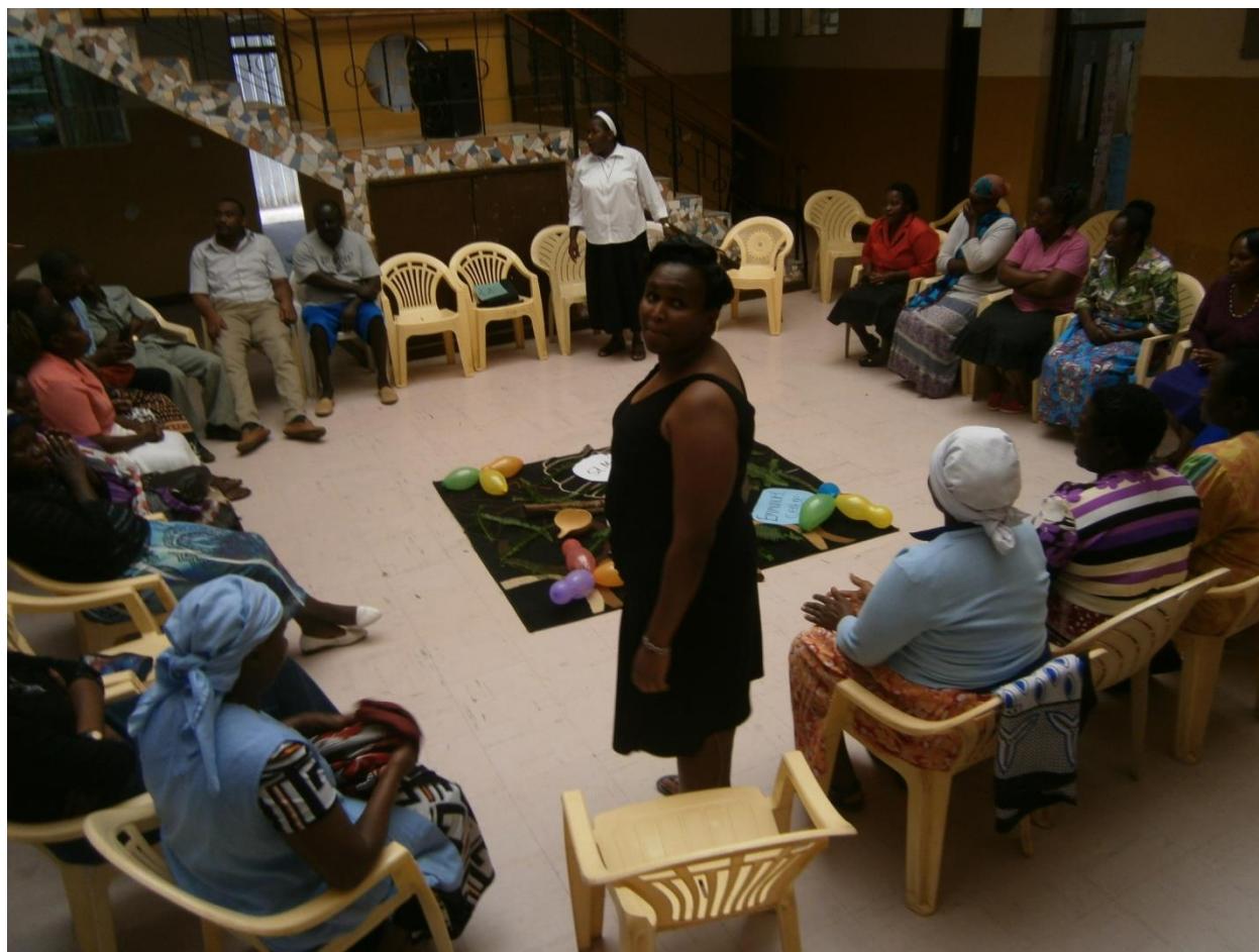
Staff workshop at St. Monica